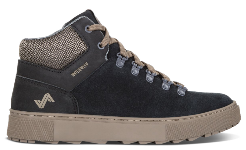
Black Multi WFW19LM9-009

Designed for those who live to do it all, the Lucie Mid is ready for your daily commutes, urban adventures and worldly explorations. Premium suede and nubuck leathers with waterproof protection ensure your feet stand up to any conditions along the way.