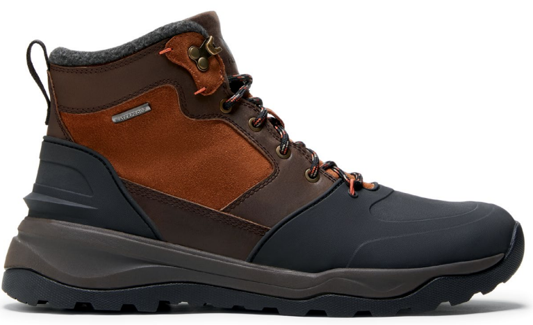
Chocolate Multi M80045_207

The Whitetail Mid is warm, rugged, and ready for anything mother nature throws its way. Molded rubber on the heel and toe offer protection from the elements, while a waterproof membrane, Thinsulate® insulation, and taped seams keep you dry and cozy through the harshest conditions. Underfoot, the GlacialGrip rubber outsole makes this sneakerboot a winter powerhouse.